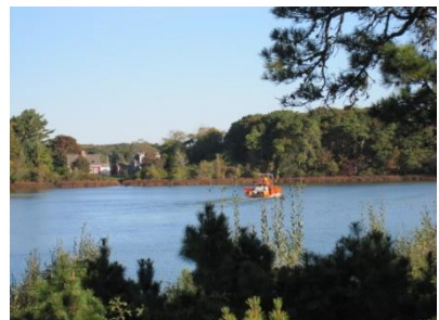
12. Application - LL North Basin