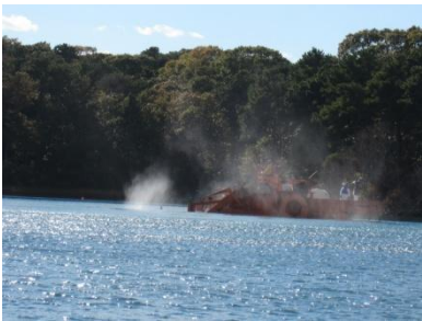
16. SP - Clearing tanks at end