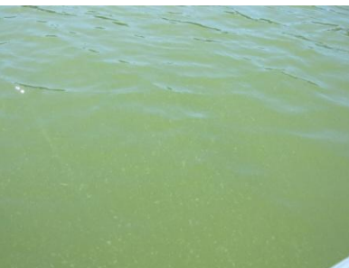
22. LL - South Basin floc particles