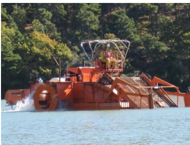
11. Application - LL Main Basin