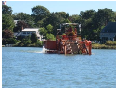
5. Application - LL South Cove