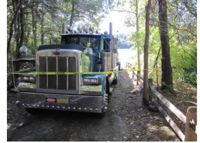
3. Alum Supply Truck