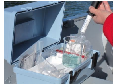
18. Alkalinity Field Test