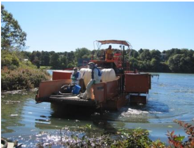
7. LL South Cove - alum tank resupply