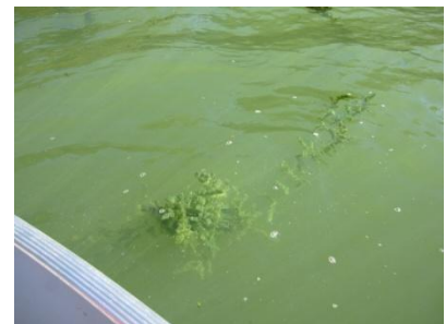
24. Floc and macrophyte