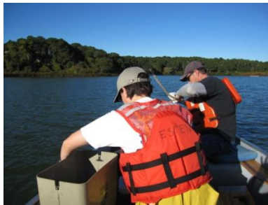
17. LL- Monitoring Water Chemistry