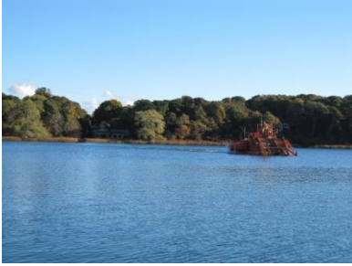
13. Application - SP Main Basin