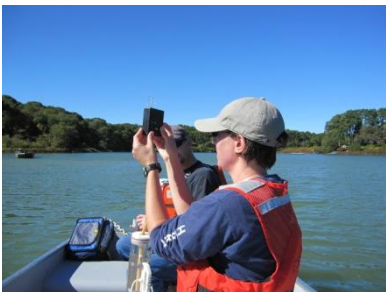
19. pH Field Test