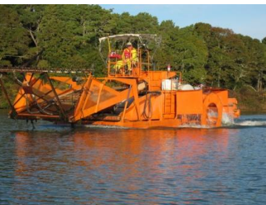
10. Application - LL Main Basin