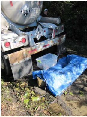
4. Spill containment materials