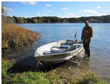
20. SP - Monitoring boat