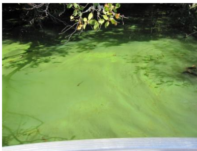
23. LL - BGA bloom near access point