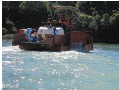
8. Application - LL South Cove