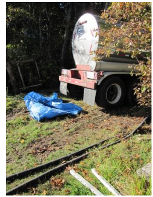
15. SP Access Point and tank truck