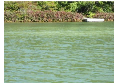
21. LL- South Basin with alum floc