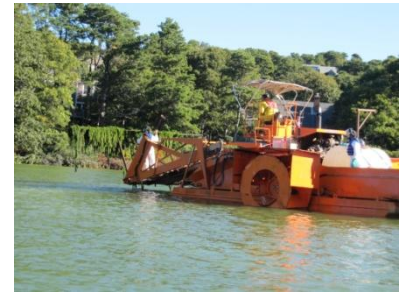
9. LL South Cove - alum tank resupply