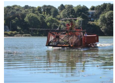
6. Application - LL South Cove