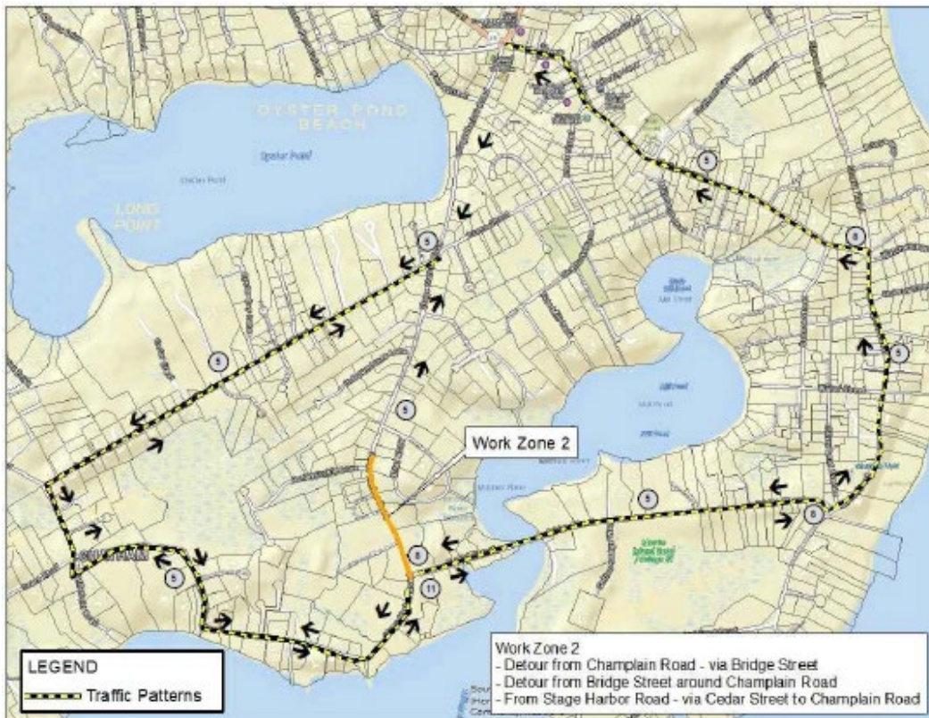
WORK ZONE 2 DETOURS - PLAN NTS