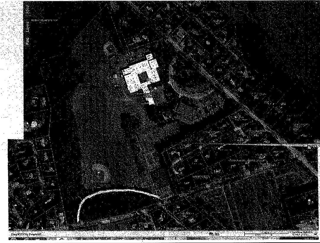
Site location. Graphic provided by petitioner.

To see if the Town will vote to transfer from available funds in the treasury a sum of money as it deems necessary for a comprehensive study of the feasibility of locating a Council on Aging building on a parcel of Town-owned land consisting of not less than 1.599 acres located south of the Chatham Bike Path on Stepping Stones Road now leased to the Monomoy Regional School District, inclusive of an Owner's Project Manager and related tasks for the completion of a conceptual design and cost estimates; authorize the Board of Selectmen to enter into negotiations with the Monomoy Regional School District in regard to use of the said parcel; and further, authorize the Board of Selectman to review this site and to expeditiously take any other action in regard thereto.